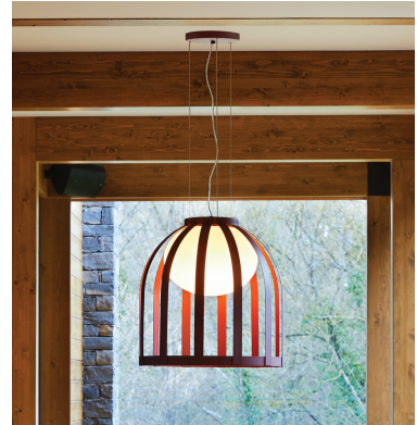
Pictures above might not show the specified dimensions or material. They are for illustration purposes only.

Aluminium suspension lamp with polyethylene shade and integrated dimmable LED. Double layer coating for high resistance to corrosion and other maritime environmental conditions. Adjustable height.