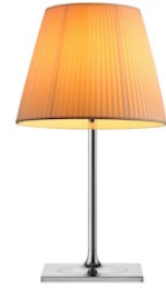
Table luminaire providing diffused lighting. Base, rod support and diffuser support in diecast, polished and chrome-plated Zamak alloy. Base cover in black injection-molded PA (Nylon). Injection-molded PC (polycarbonate) opal inner diffuser. Outer diffusers in transparent or fumée PMMA (polymethylmethacrylate), and silver or bronze on the inner surface, by vacuum aluminum coating. Injection-molded PC (polycarbonate) upper ring, completely transparent or transparent diffuser and silver diffuser) or transparent brown for the outer bronze diffuser.